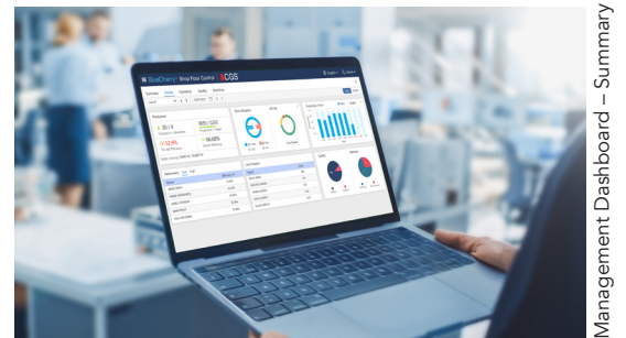
Management Dashboard – Summary