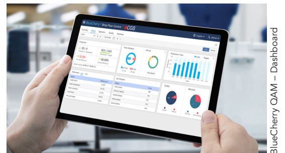
BlueCherry OAM – Dashboard